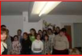
Christmas Production at Centre

The Romanian Prader Willi Association – RPWA was created in May 2003, in order to bring together the efforts of patients, specialists and families to ensure a better life for all people with disabilities in Romania. In October 2005 they opened an Information Centre for Rare Genetic Diseases . This was the first centre of this type in Romania.