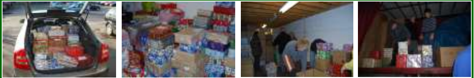
Presents were collected, delivered, sorted and then loaded onto the lorry.

A group of 8 ROAD members made the long trip early in December.