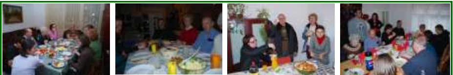
Group members were overwhelmed by the generosity of families for their hospitality, with some putting on a pound or two!