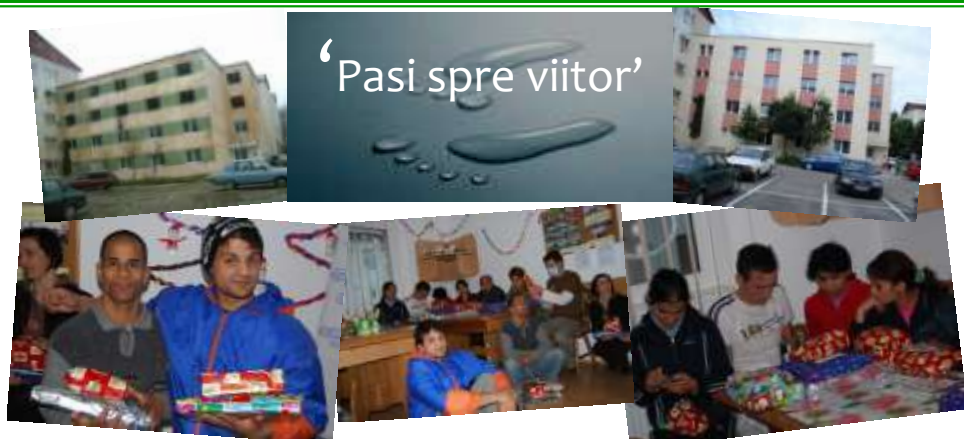
The residents of the Pasi spre viitor centre have enjoyed their first Christmas together. The photos show some of the residents opening presents kindly donated by ROAD members.