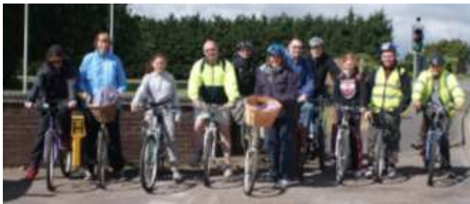
The eleven cyclists lined up in Bardney ready to start.

Everyone arrived back safely and now have the task of collecting the sponsor money. Early indications are that £1100 will be raised. This will be split 50/50 with ROAD and Acts Trust. When the total is known an update will be posted on the ROAD website. Thank you to all the riders who gave up their time and also to everyone who sponsored them.