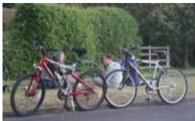
Well deserved rest & lunch.