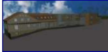
Artists impression of new centre