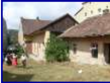
Site of new centre

The centre will help many individuals and their families from all over Romania. Facilities at the centre will include a hydrotherapy pool, access to medical advice, therapists and much more. ROAD have supported the centre by being a partner charity. Full details of the opening will be on the website and in the next newsletter.